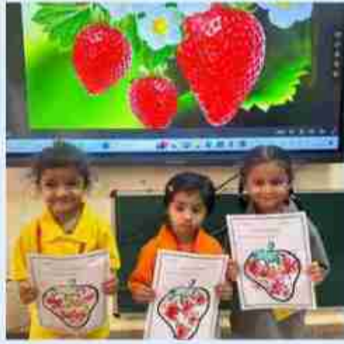
RED JUICY STRAWBERRY