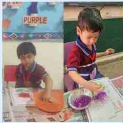
T IS FOR TULIP