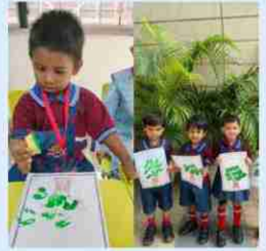
MY MAJESTIC TREE