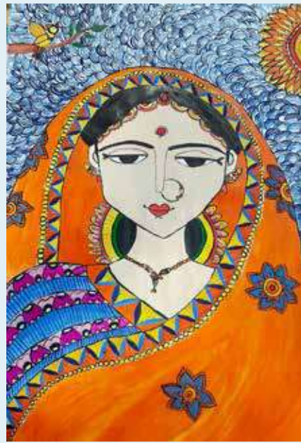
Navseerat Kaur 12F