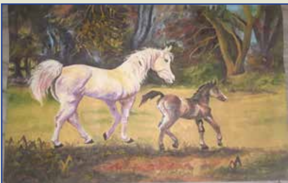
Divyanshi Tayal Class - XE