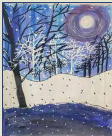
Shrisho Dutta Class - 7B